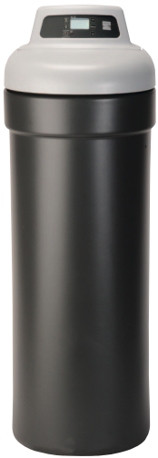
Kenmore Extra High Efficiency Water Softener